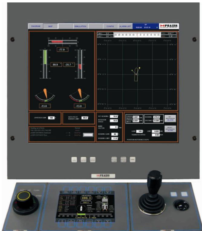
Mega-Guard DP comes with 19" to 26" TFT screens