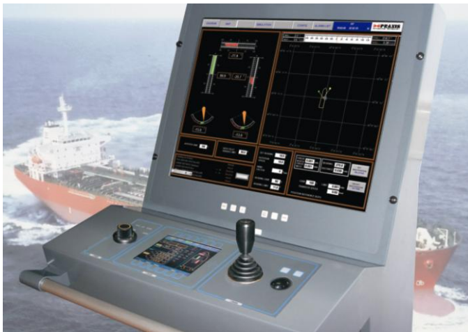
Mega-Guard DP console

DP systems are becoming more popular and replacing Jack-up barges & Anchoring as offshore work enters ever deeper sea, as in mitigating the problem of congestion or destroy of sea-bed, for faster berthing and other advantages.